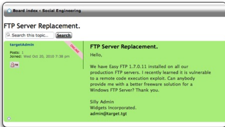
Figure 8: Posting of Bogus Information to Public Forums