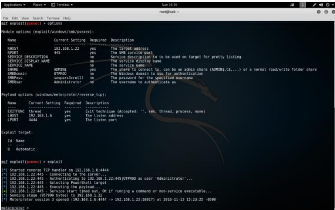
Figure 12. Metasploit PsExec Module to Connect to 192.168.1.22

The “exploit” command runs the module which results in a meterpreter session, giving the attacker access to the remote system at IP address 192.168.1.22 as seen in Figure 12. Figure 13 displays the Bro notice log, verifying detection of Metasploit PsExec module use of ADMIN$ and IPC$ shares, as well as use of the random hostname “Nhyl80UC9iXFecJH”.