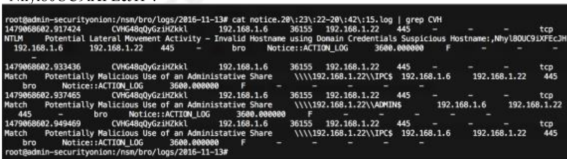
Figure 13. Bro Logs following The Metasploit PsExec Activity

The “exploit” command runs the module which results in a meterpreter session, giving the attacker access to the remote system at IP address 192.168.1.22 as seen in Figure 12. Figure 13 displays the Bro notice log, verifying detection of Metasploit PsExec module use of ADMIN$ and IPC$ shares, as well as use of the random hostname “Nhyl80UC9iXFecJH”.