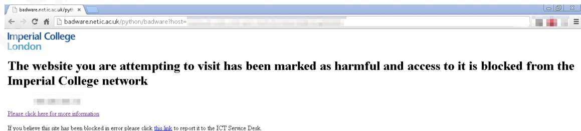
Figure 2: Example of what a client would see in the browser on an attempt to access a harmful site.

Instead of returning NXDOMAIN for a malware site, the site can be aliased (CNAMED) to an internal web server that displays the organisation's logo and information about the site the client attempted to visit, see figure 2.