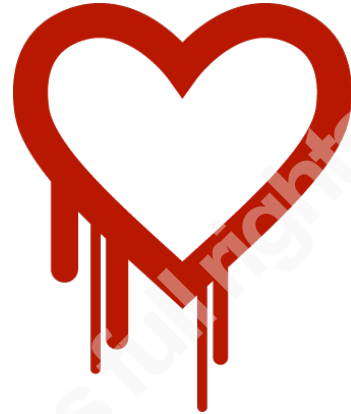
The Heartbleed logo