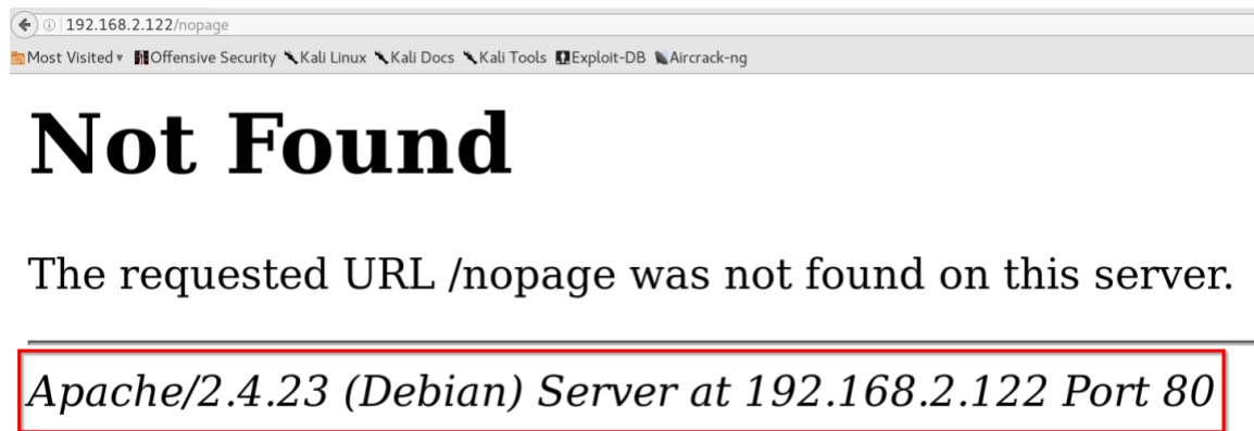
Figure 12. A default error page disclosing information about the server

version information. If the error message contains only information such as the HTTP response code and contact numbers, then the application receives full credit.