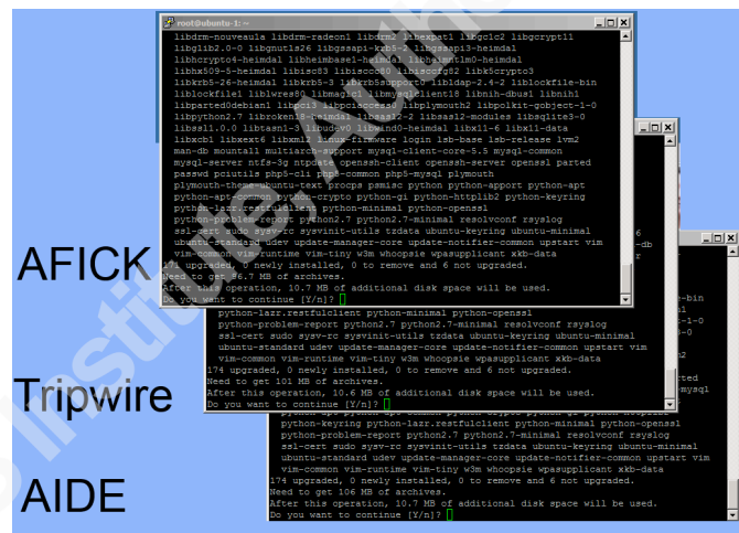
Figure 1: First Patch Session

The guest operating system and installed IDS package were started a month earlier. As a test of the performance of the file integrity checking applications, a significant amount of identical changes had to be made to each system. Since that initial build and software installation, there were packages upgraded and available for installation. For the PostFix mail server IDS (Tripwire/AIDE), there were 174 packages, while the Perl-based AFICK had only 171 packages upgraded. Applying this variety and volume of patches served as a reasonable benchmark for measurements of the file integrity checking applications.