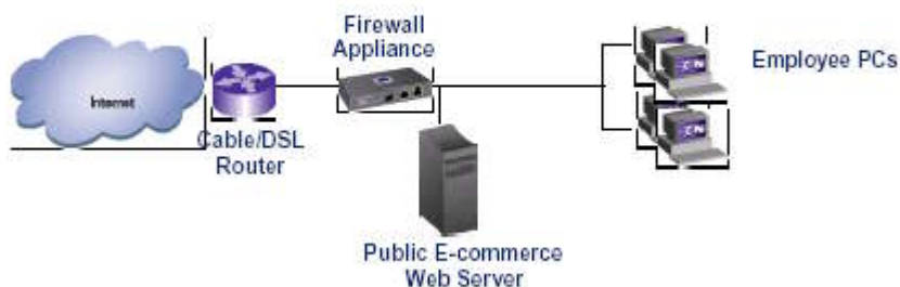
Figure 2: Secure Small Business with a Locally Run Web Server

SOHO attached to the broadband Internet need to make sure they have a firewall security solution in place that can allow employees to access the Internet, while preventing unauthorized access to the internal network (see Figure 2). If they want to run a web server on their premises it will require that they add more sophisticated security policies to allow outsiders web access to just that server and not the rest of the network. Other security functions they may want include: deterring denial of service attacks launched against their network, preventing the launch of a DoS attack from within their network (e.g., prevent IP spoofing), and implementing URL filtering to prevent employees from surfing to inappropriate web sites.