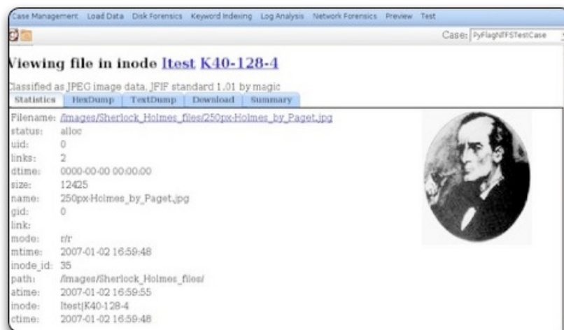
Figure 20. Screenshot of pyFlag forensic tool.