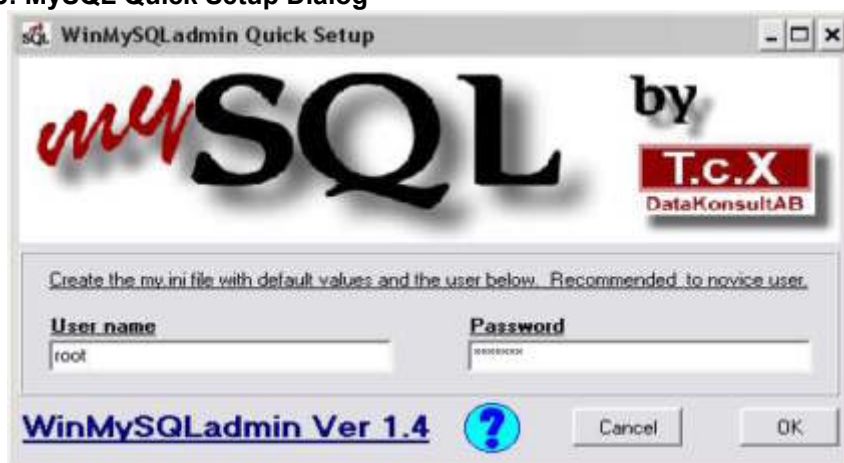
Figure 3: MySQL Quick Setup Dialog

The administration tool will create the c:\%windir%\my.ini configuration file and setup the MySQL service to start automatically when Windows starts.