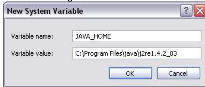
Figure 2: System Variable Dialog