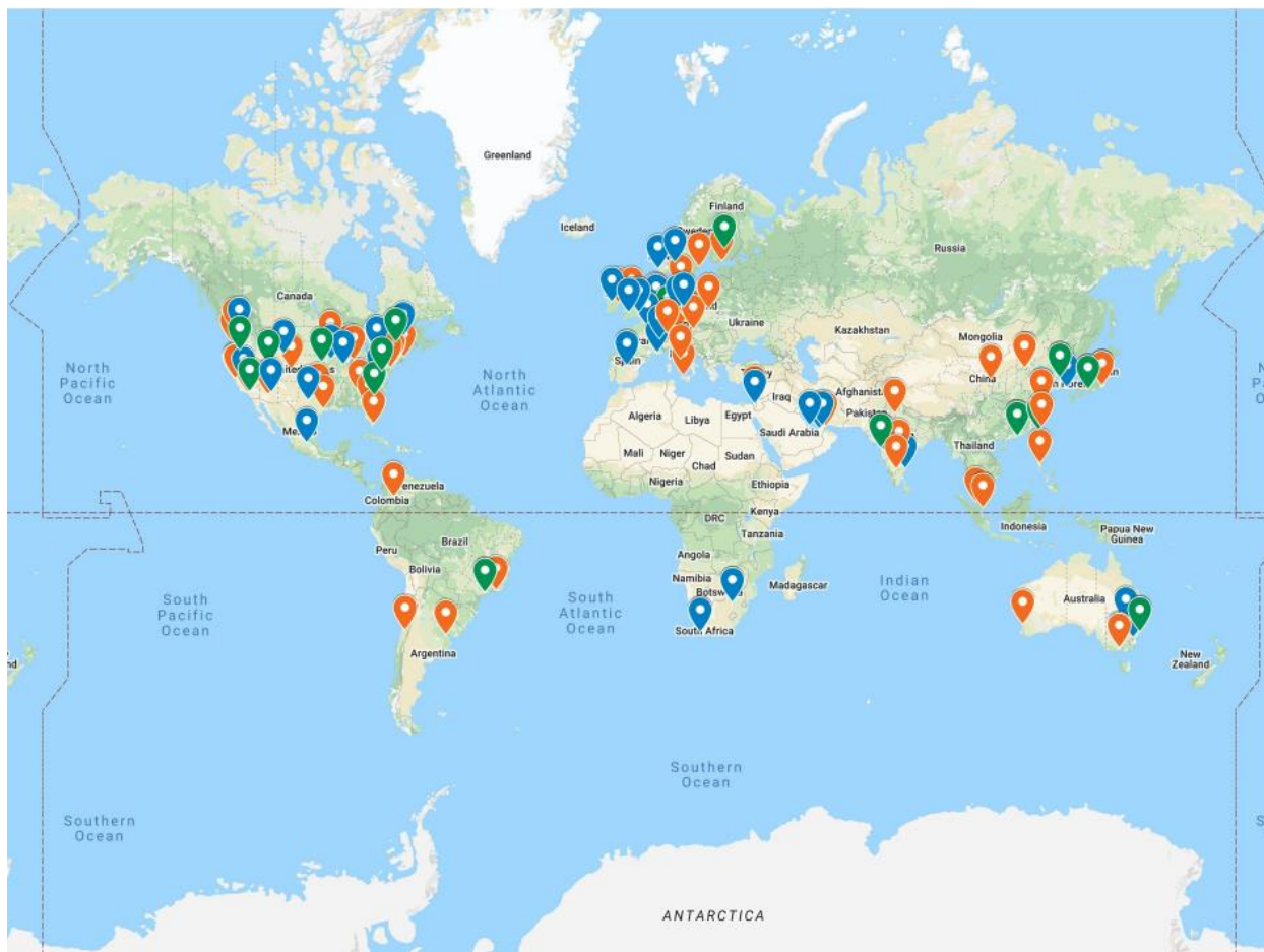
AWS's cloud infrastructure is represented with orange markers, while Azure's are blue and GCP's are green. https://www.google.com/maps/d/viewer?mid=1WKYlcUMJKnOnIvmGkn82Ek0TZAgKmFj3

AWS and Azure have fairly comparable and robust coverage, so you can host your resources in most regions of the world, barring Russia , with each. It is hard to make the same argument for GCP, which has zero presence in both Africa and China. Although Google claimed in 2018 that it will “offer mainland services” , they have yet to deliver on this promise.