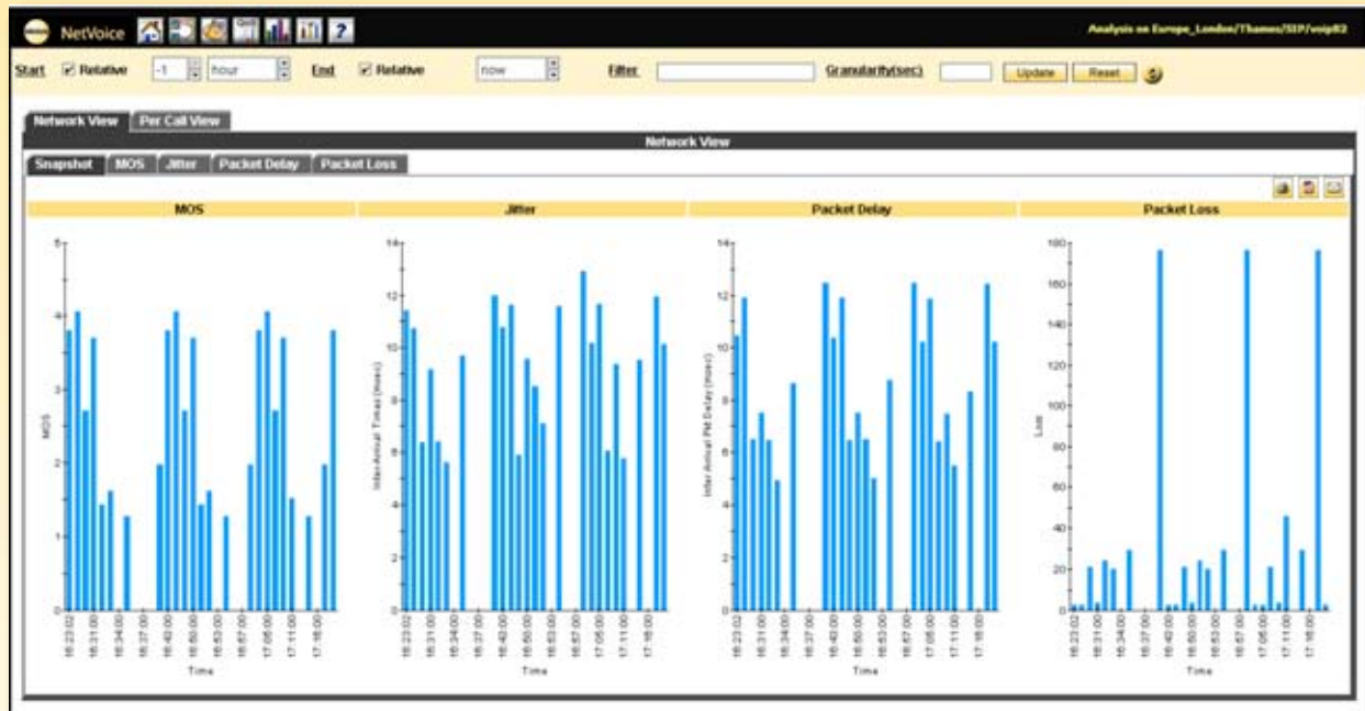
Figure 4: Hourly VoIP traffic load showing MOS, jitter, packet delay and packet loss