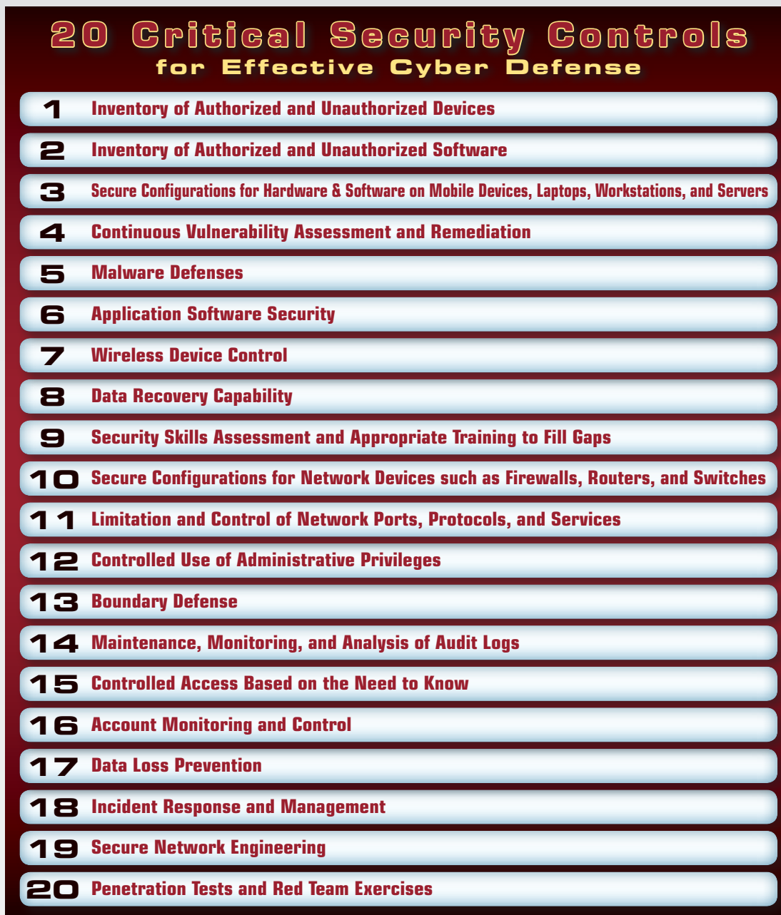
Figure 1. The Critical Security Controls

Today we have a whole ecosystem of layered security—endpoint protection, application protection, network protection and end-user controls—which must carry us through a variety of use cases. One set of guidelines coming into increasingly common use is the Critical Security Controls, listed in Figure 1.