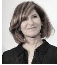
Amy Pascal CEO, Sony