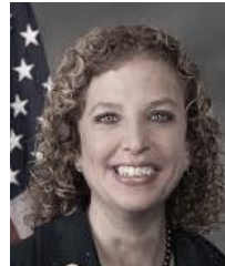
Debbie Wasserman Schultz Chair, DNC