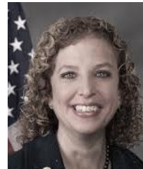
Debbie Wasserman Schultz