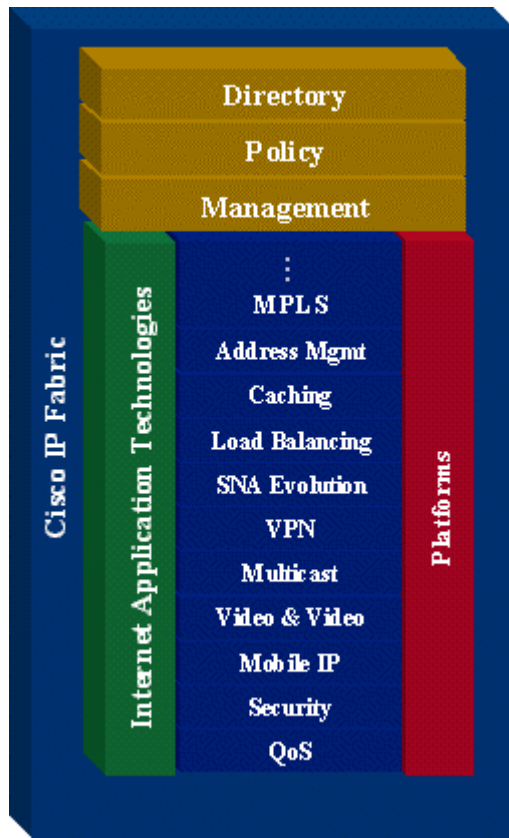
Figure 4 Cisco IOS® Software Intelligent Network Services

Internet. Part of that security consists of “hardening” the routers. Having hardened routers, in conjunction with hardened switches, servers and applications, assists in having another layer to a “defense in depth” scheme.