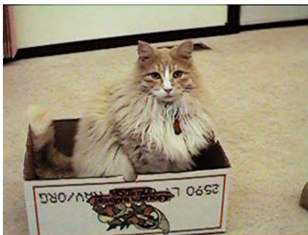
Figure 1 Picture of Family Cat Containing An Encoded Message

Today, it is not uncommon to use a combination of the two technologies with messages being both encrypted and inserted into an image.