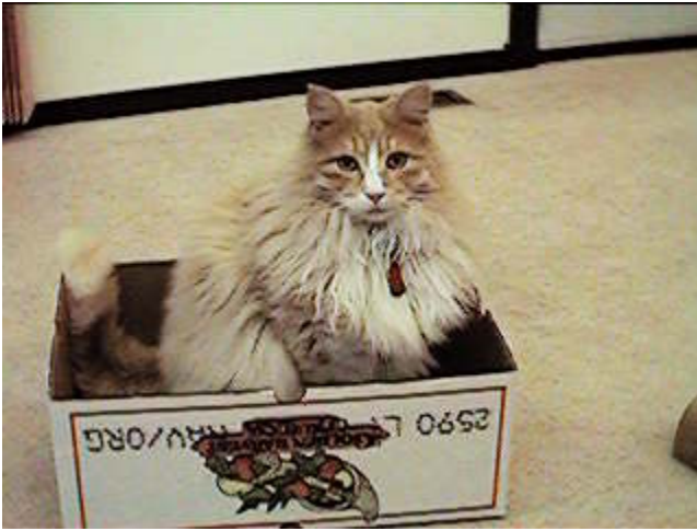
Figure 2 Original Picture