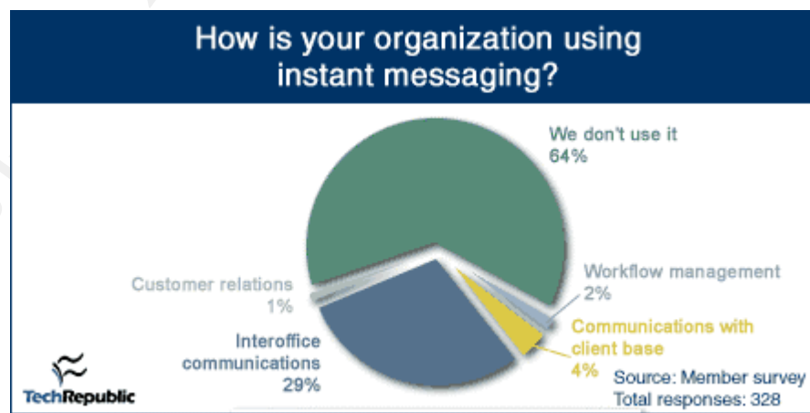
Figure A: “Most organizations aren't using IM” June 12, 2001 TechRepublic Staff

Since its beginnings, ICQ has developed into more than simple instant messages, now there are user-created interest lists, public chat-rooms, new clients and enhancements, virtual communities, and its own Intranet Server for enterprises soon followed. SMS is an IM solution that developed in Europe as the European answer to mainstream IM products. However, in June of 1998, Mirabilis' assets were acquired