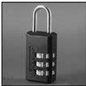
FIGURE 1. Master Lock brand Classic Black Luggage lock

For our example we will think of the combination for the lock as being a password. Each digit in the combination, or place in the password, can take values from 0 to 9, a total of 10 unique values, (0_1, 1_2, 2_3, 3_4, 4_5, 5_6, 6_7, 7_8, 8_9, 9_{10}) . The password for a 3 digit luggage lock would have 1,000 different combinations. So, a four digit lock allows 10,000 different passwords. Expressing this as an equation: