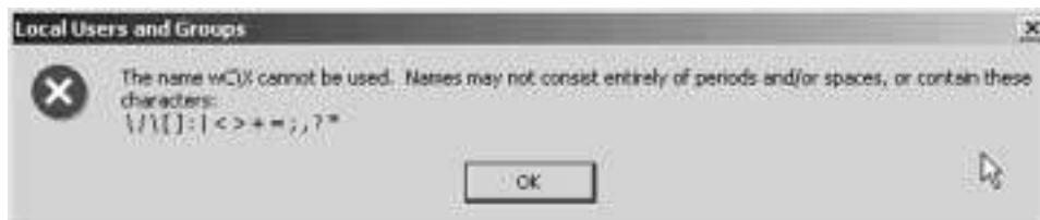
FIGURE 4. Windows Allowed Symbols for Account Names

a. Space is allowed, but not shown (it would be a blank square!).