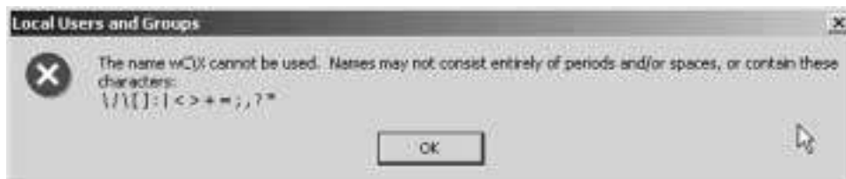
FIGURE 4. Windows Allowed Symbols for Account Names

a. Space is allowed, but not shown (it would be a blank square!).