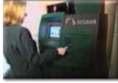
Figure 5: EYE TM in Houston, TX