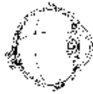
Figure 1: Iris

The human Iris is an internal organ of the eye, protected by the eyelid, cornea and the aqueous humour. It is part of the middle coat of the eye and lies in front of the lens. It is the only internal organ of the body that is normally visible externally. One of its distinctive characteristics is its stability. The iris features remain constant throughout the years. The iris is composed from several layers. Among the visible features of an iris throughout the layers are multiple collagenous fibres, contraction furrows, coronas, crypts colour, serpentine vasculature, freckles rifts and pits. It is seen in cross-section in the anatomical drawing of Figure 1.