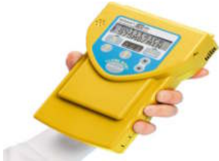
The Logicube Forensic Solitaire 12

to make. My experience using Disk Scrub on 12 GB laptop drives with 3 overwrite passes averages about 5 minutes. So there really is no reason to neglect this crucial step in preserving evidence since it is fast, easy and essential.