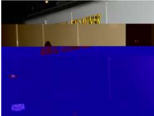
Foremost - jpg #24

open them with an image software editor, for instance the Foremost carved file #24 (00649204.jpg) is the file #15 within the image, a four fragmented file with fragments in non-sequential order. Following the two jpg files are showed in order to be compared: