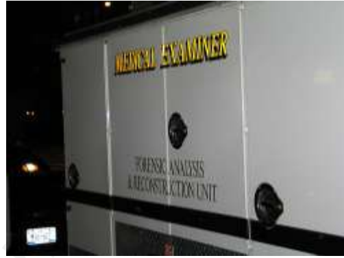
dfrws original file - jpg #15

There were five submissions to the DFRWS 2007 Forensics Challenge, at the time of challenge, existing tools could not handle the presented scenarios and new techniques had to be developed. To summarize the result, the winner developed dedicated validators for pdf, zip, mime, html and mpeg and even though he did not focus on image and office file formats, his results still ended up very high, with the lowest false positive score. The second place, authors of the challenge developed several new tools for specific file types and the structure-based tool for mp3 files scored better than the other submissions; the third place author used a combination of techniques and all the pdf files were found with a tool that scans the image for PDF\Title headers and then searches the web. In fact, this is the only way that fragmented files were recovered, authors of the fourth place used an approach which combines file structure details, content analysis, and block-based carving they released a tool called Revit07 a file carver