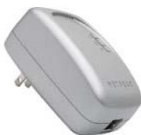
Netgear XE102 7

By inserting a network cable into a device like Netgear's XE102 7 and then plugging it into an electrical outlet, an individual can turn a building's electrical wiring into a 56-bit DES encrypted network that cannot be sniffed or detected like wireless. By using a second EoP device, an intruder can be anywhere in a building and casually search for and steal data without revealing his real physical location. If an EoP device is discovered, it will most likely be overlooked as a power supply or some sort of surge protector.