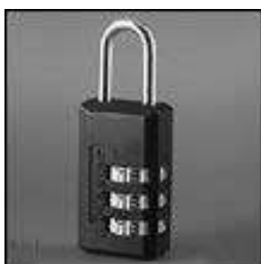
FIGURE 1. Master Lock brand Classic Black Luggage lock

For our example we will think of the combination for the lock as being a password. Each digit in the combination, or place in the password, can take values from 0 to 9, a total of 10 unique values, (0_1, 1_2, 2_3, 3_4, 4_5, 5_6, 6_7, 7_8, 8_9, 9_{10}) . The password for a 3 digit luggage lock would have 1,000 different combinations. So, a four digit lock allows 10,000 different passwords. Expressing this as an equation: