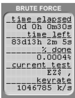
FIGURE 2. LC4 Time to complete crack estimate

The passwords and results from this simple experiment are provided in Table 2 on page 20 and in Figure 3 on page 21. Looking at the table shows that none of these are particularly easy to guess passwords, however short they may be. Several concepts were illustrated with this simple exercise. First, with a limited password space, most notably the 4 character, it is difficult to randomly generate a truly strong password. PCP is configurable such that only upper and lower case, numbers, and symbols are used in the created passwords, but even with multiple runs, it was still difficult to collect enough different characters to create 5 truly strong 4 character passwords. Also, this experience shows that the concept of password space is useful, and having a small password space truly reduces password strength. The passwords with small password spaces were cracked very quickly, and the passwords with larger password spaces took longer to crack, or were not cracked, even after 6 days of guessing attempts. Truly strong passwords do take significant time to crack, at least 6 days. But it is true that all the passwords, even 14 character ones, would have been cracked in less than 90 days. LC4 has the capability to distribute the brute force cracking task over many machines. The author was able to prepare the distributed crack for 100 different computers. The experiment