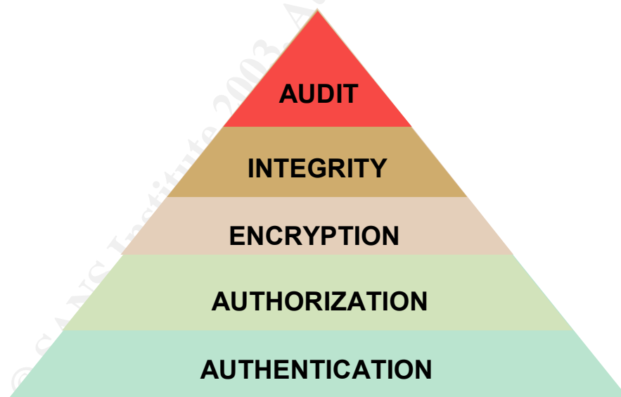
Figure 1: Security Pyramid

We will begin by categorizing security into five different layers as seen below in Figure 1.