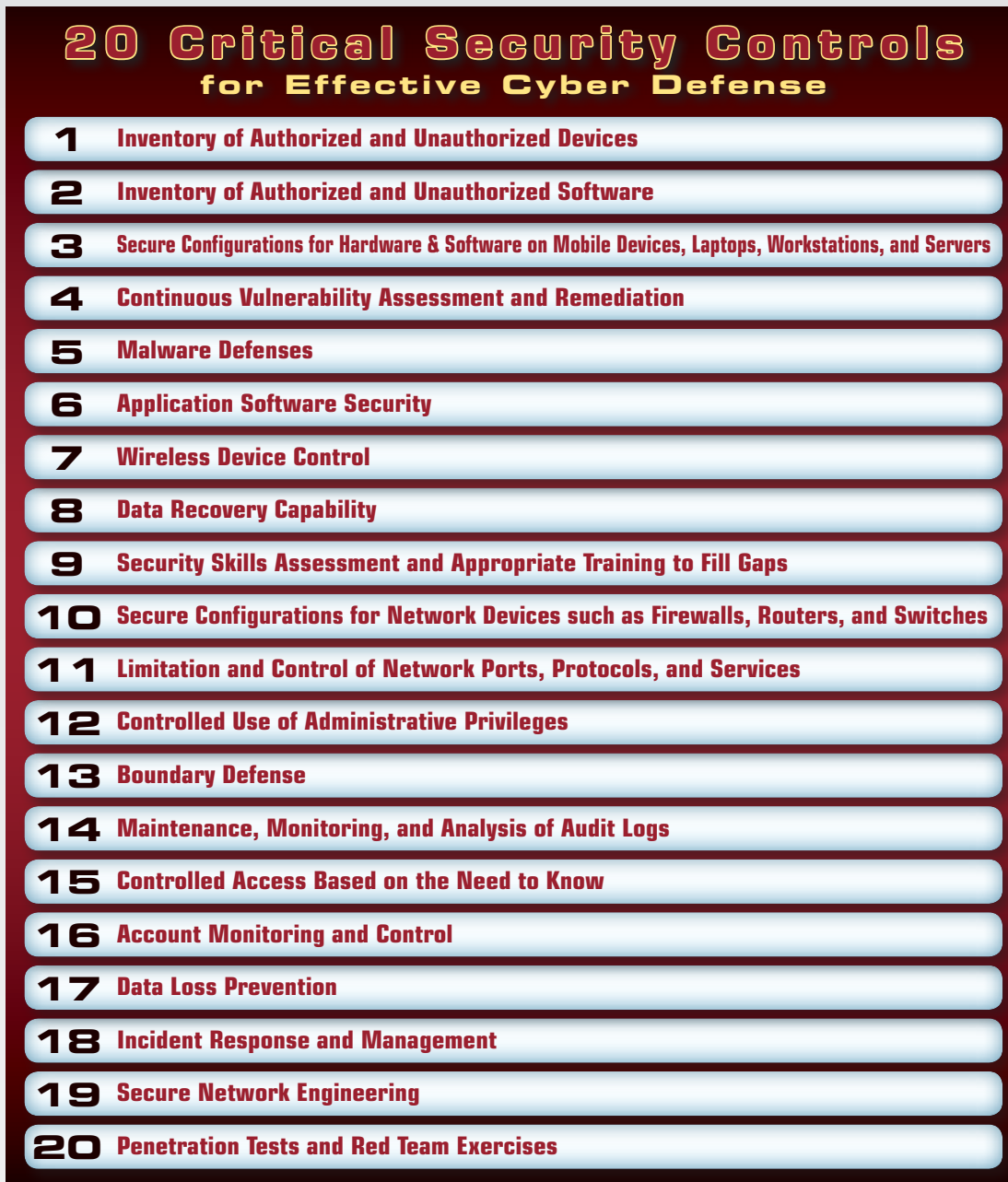
Figure 1. The Critical Security Controls

Today we have a whole ecosystem of layered security—endpoint protection, application protection, network protection and end-user controls—which must carry us through a variety of use cases. One set of guidelines coming into increasingly common use is the Critical Security Controls, listed in Figure 1.