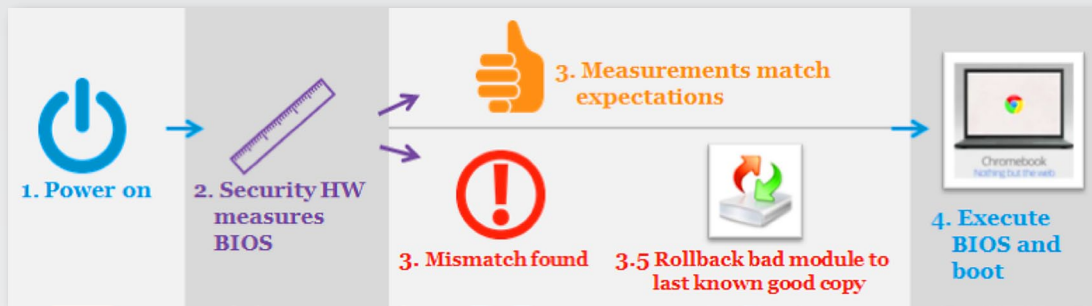
Figure 1. TPM Root of Trust Attestation on Chromebook Architecture

The Chromebook, a $250 consumer-grade netbook offered by Google and made by Samsung, among others, is one example of a consumer-oriented product that has a TPM built in. Google's process is illustrated in Figure 1.